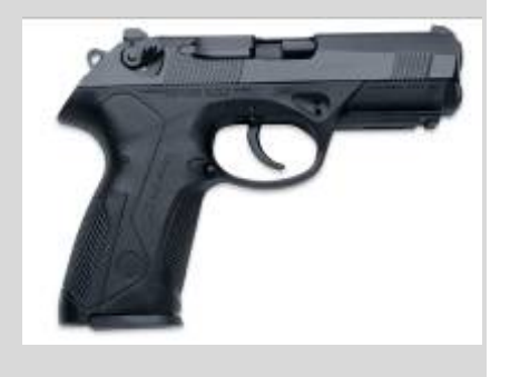
A PX4 Storm semi-automatic pistol